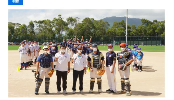
圖集 | 第65屆體育節傳承棒球共融日開幕