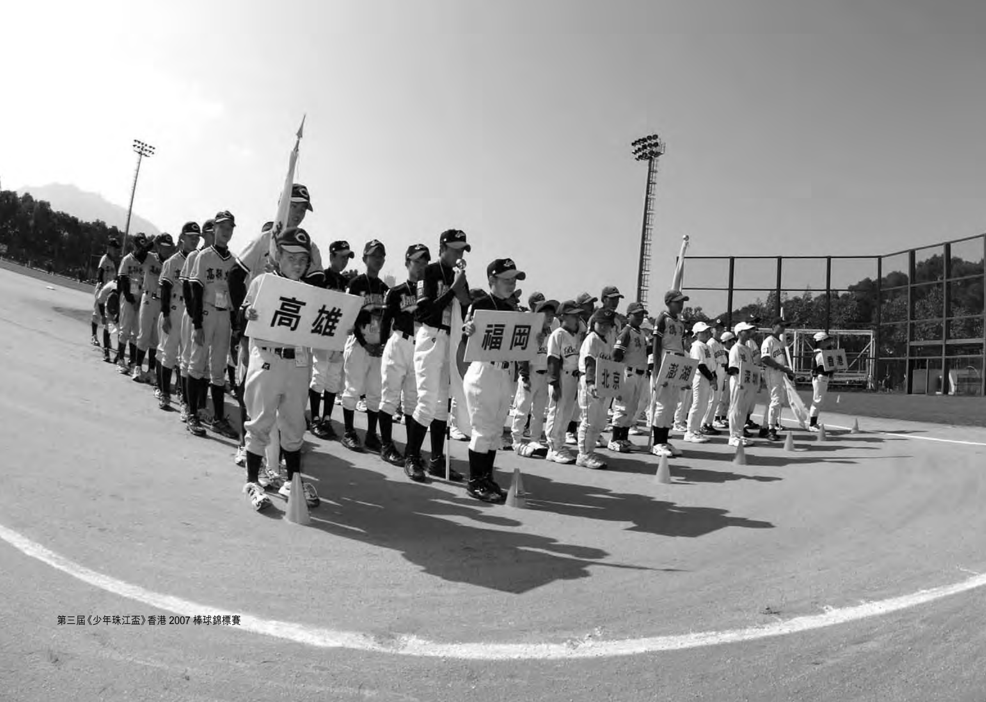
第三屆《少年珠江盃》香港 2007 棒球錦標賽