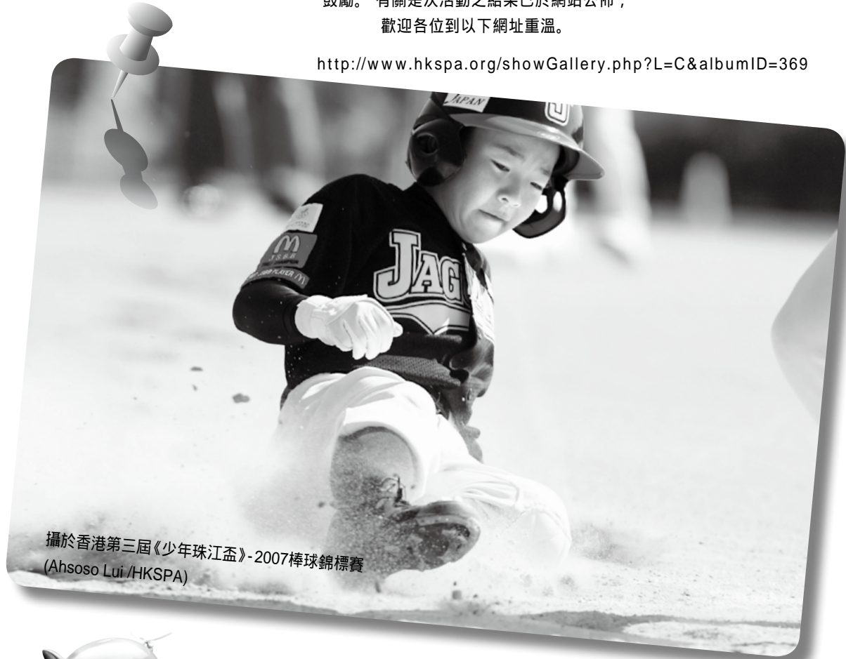
攝於香港第三屆《少年珠江盃》-2007棒球錦標賽 (Ahsoso Lui /HKSPA)

http://www.hkspa.org/showGallery.php?L=C&albumID=369