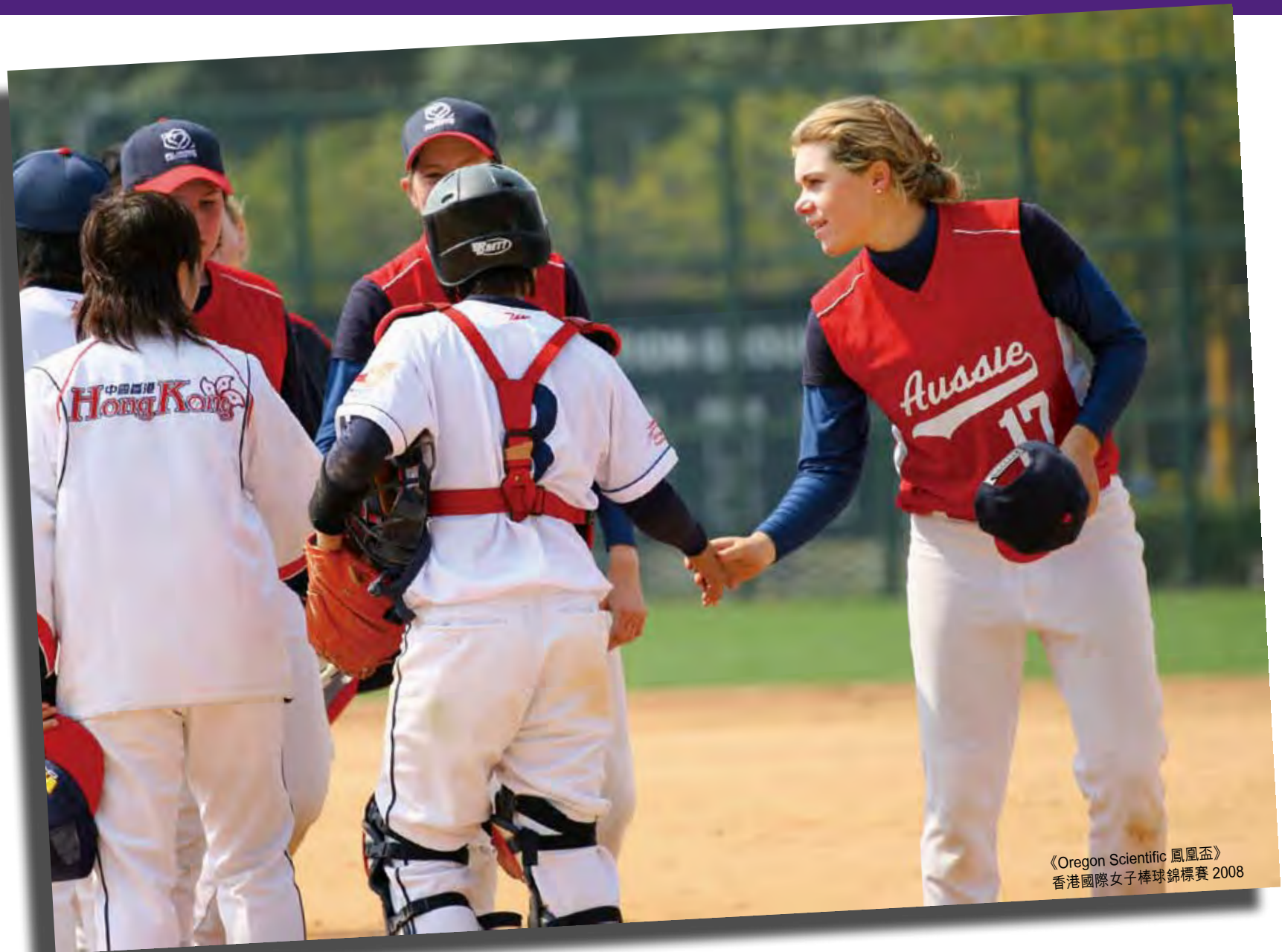
《Oregon Scientific 鳳凰盃》 香港國際女子棒球錦標賽 2008