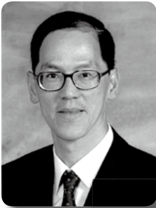
Mr. Tsang Tak-sing, JP Secretary for Home Affairs