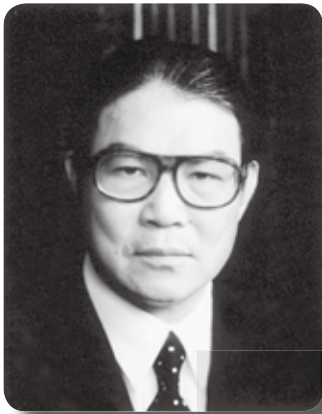
The Hon. Timothy T. T. Fok, GBS, JP President of Sports Federation & Olympic Committee of Hong Kong, China